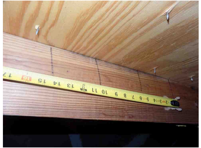
8D Nails Every 6 Inches