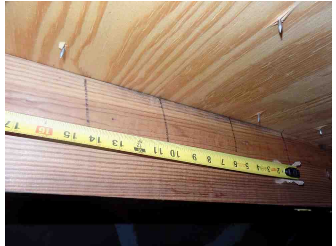
8D Nails Every 6 Inches